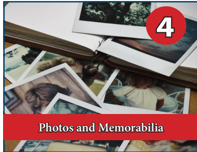
Photos and Memorabilia