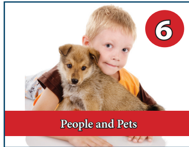
People and Pets