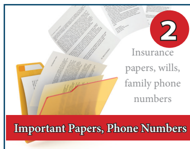
Important Papers, Phone Numbers