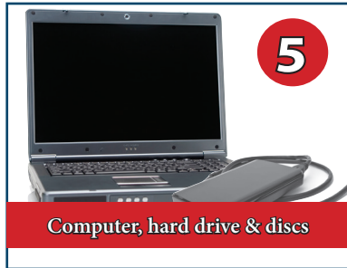
Computer, hard drive & discs