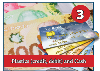
Plastics (credit, debit) and Cash